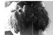
9/11: Re-examining the 3 high-rise "collapses"